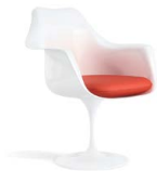
Tulip Arm Chair 26"W × 23¼"D × 32"H