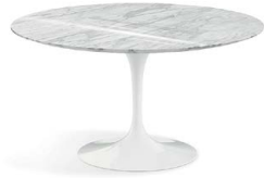
Saarinen Dining Table Round* Various sizes