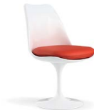
Tulip Armless Chair 20"W × 21¼"D × 32"H