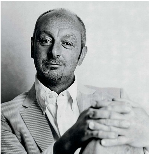
Piero Lissoni (left), Concept sketches of the shape and construction of the table's legs, inspired by the design of a grasshopper's anatomical structure (below)