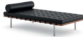
Barcelona® Couch 39"W x 78"D x 25"H