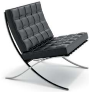
Barcelona® Chair 29½"W x 30"D x 30¼"H