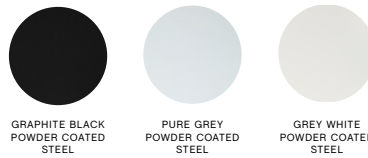
GRAPHITE BLACK POWDER COATED STEEL